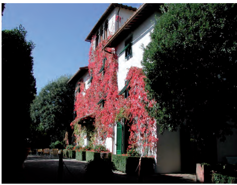
Villa le Barone

The Eden Hotel Wolff has been one of the leading names in Munich since its foundation in 1890. The Art Noveau building is ideally located opposite Munich Central rail station, making it the perfect stopover point from which to explore the city. The hotel has 210 rooms and suites on offer to guests in a variety of designs from classical through to elegant modern or Alpine stylings, whilst the hotel's restaurant the Peter & Wolff prides itself on the use of seasonal products from the regions suppliers in its menus.