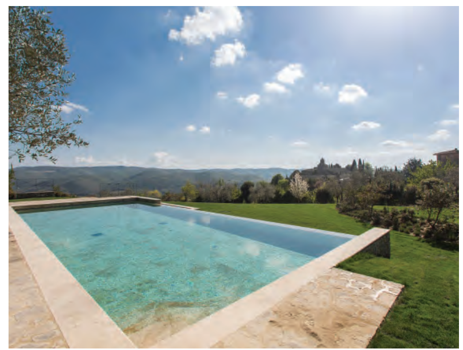
Infinity pool at Villa le Barone

Spend 6 days exploring the Chianti region and the fascinating art cities of Tuscany. Take the opportunity to discover the patchwork vineyards of Montalcino, the spas of Montecatini and Saturnia and the islands of Elba and Giglio. However you choose to spend your time in Tuscany, you will be inspired by the beauty of your surroundings